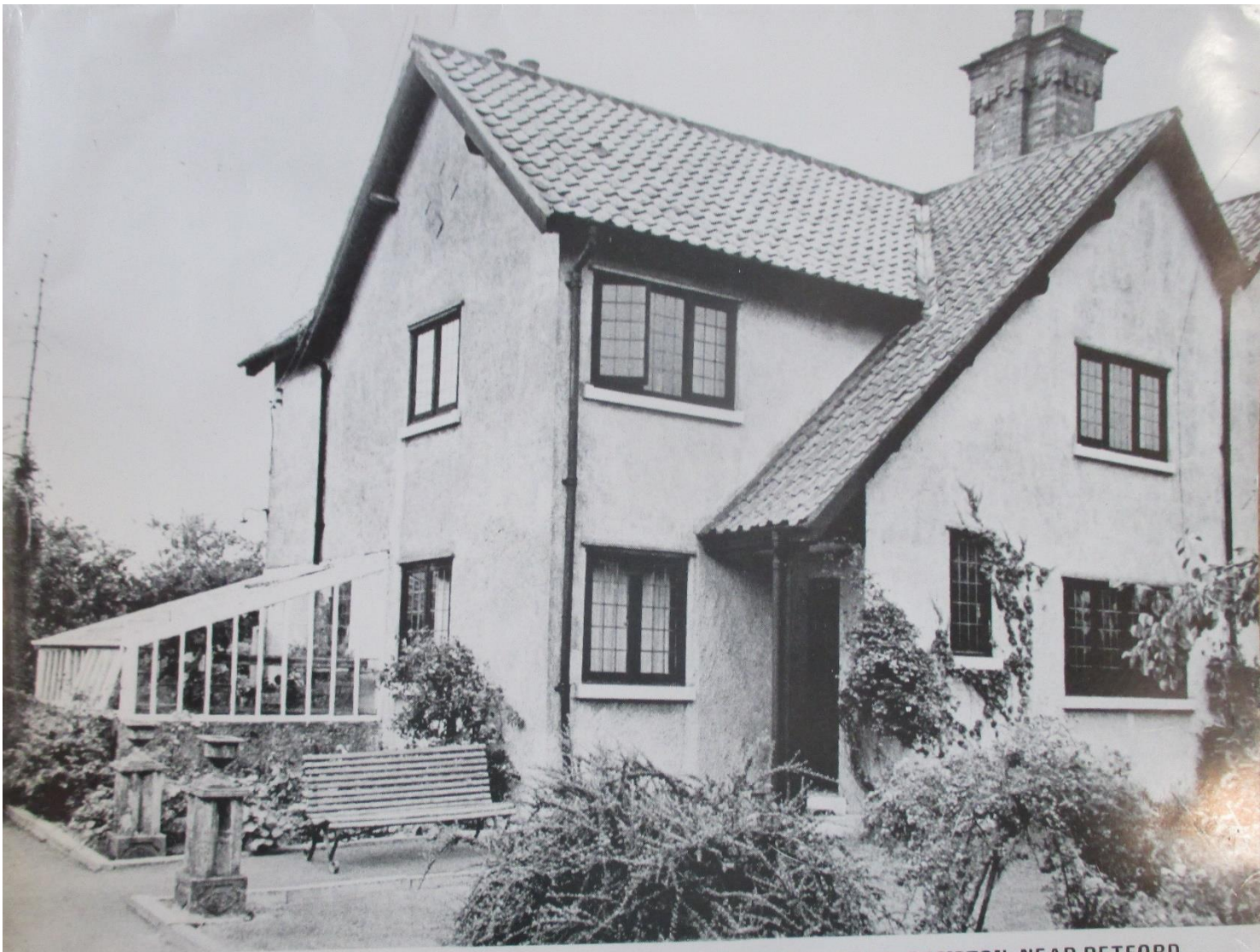
THE GABLES, TRESWELL ROAD, RAMPTON, NEAR RETFORD.