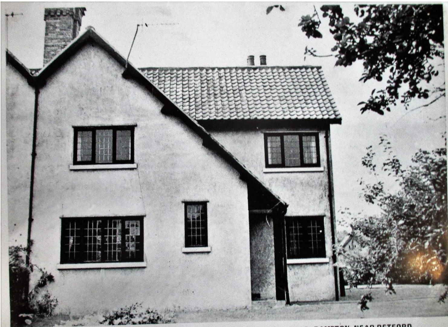
SWISS COTTAGE, TRESWELL ROAD, RAMPTON, NEAR RETFORD.